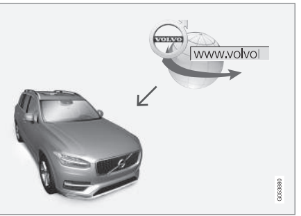
Remote update procedure.

The navigation system's ^{\ast} maps can be updated ^{24} when the vehicle is connected to the Internet.