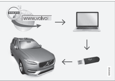
Computer/USB flash drive update