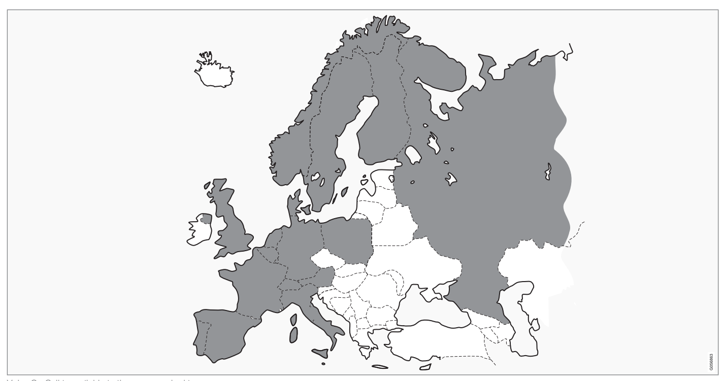
Volvo On Call is available in the areas marked in grey.